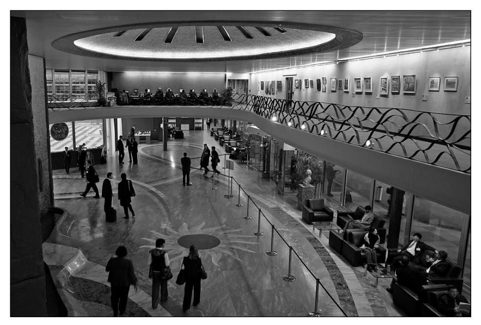
Figure 2. Foyer of WIPO's main building in Geneva.