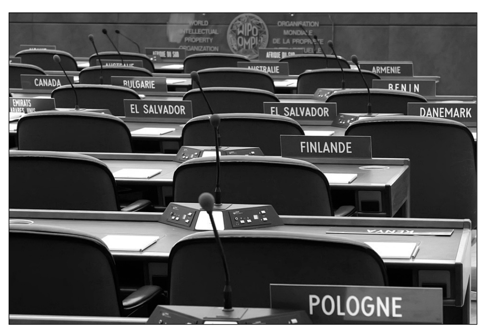
Figure 4. Seats of national delegations in WIPO's plenary room in Geneva.