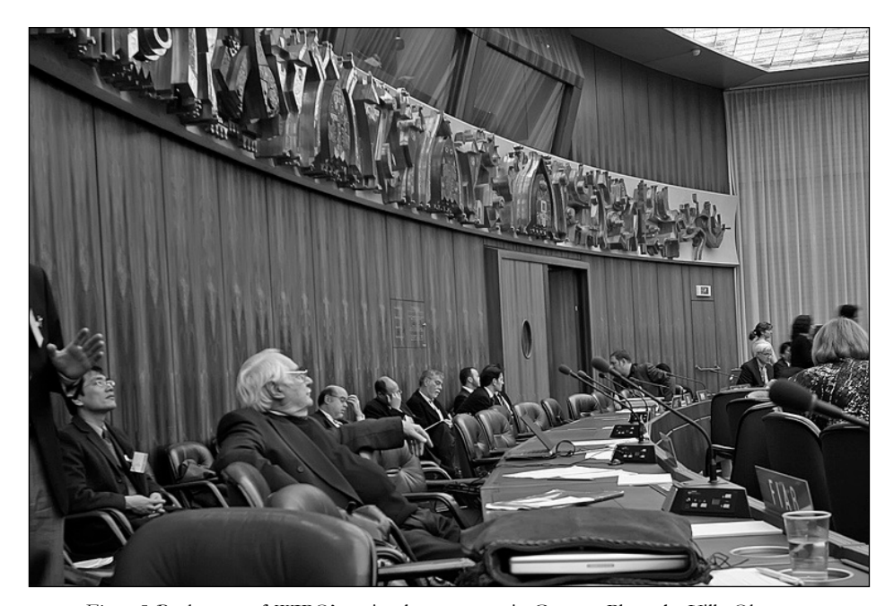
Figure 5. Back rows of WIPO's main plenary room in Geneva.