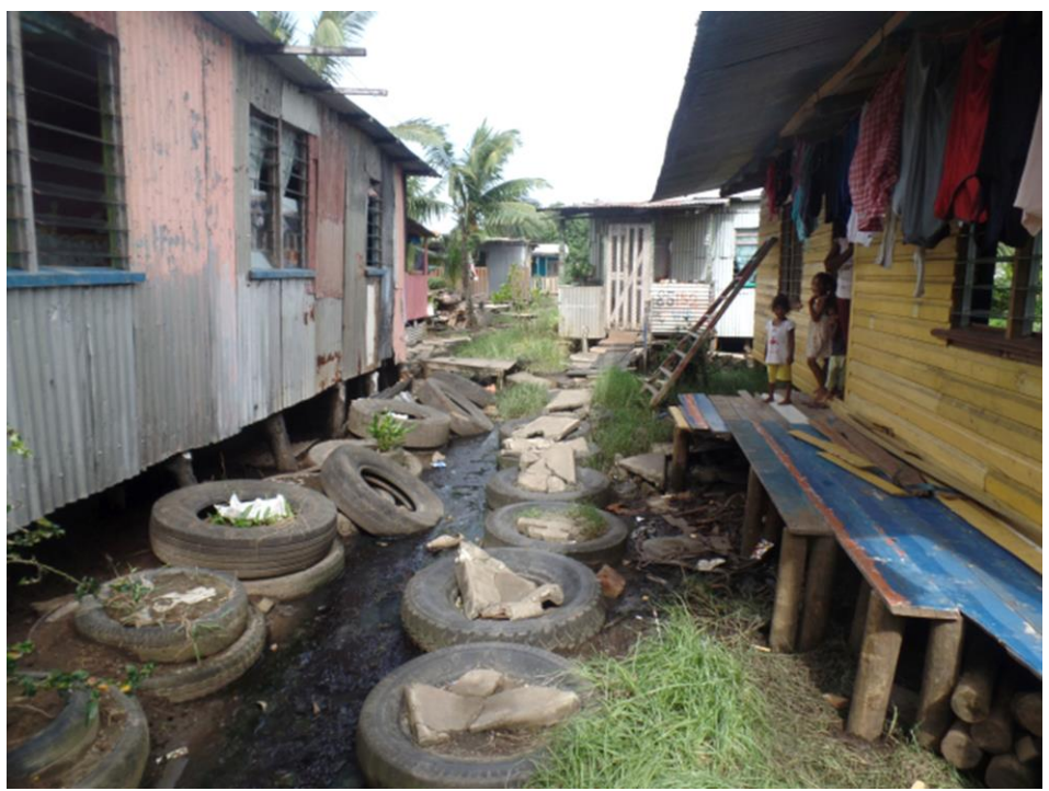
Figure 2: Coping with flooding in Veidogo settlement, June 16, 2017.

environmental concerns) are by far the most prevalently reported. Although people differed slightly in expression (flooding, high tide, waterlogging) they all meant essentially the same thing: twice a day, the settlements are flooded as a result of tidal activities. Houses are rarely flooded, but the ground becomes very muddy even during low tides and causes severe inconvenience for people walking between the houses. The situation worsens especially in Muanivatu when heavy rainfall makes the Vatawaqa River rise. As most mangrove forests west of the settlement have been removed recently, flooding has significantly increased. During extreme flooding, septic tanks overflow and surface water mixes with sewage, causing severe health hazards.